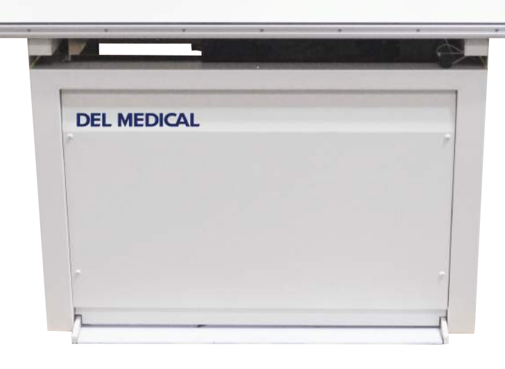
Foot treadle electric lock release runs the entire length of pedestal.

This sturdy table is ideally suited for a variety of general radiographic needs including small hospitals, clinics, ambulatory care centers and private offices. The floating table top glides freely on a precision roller bearing system and can support patients up to 700 lbs. (318 kg).